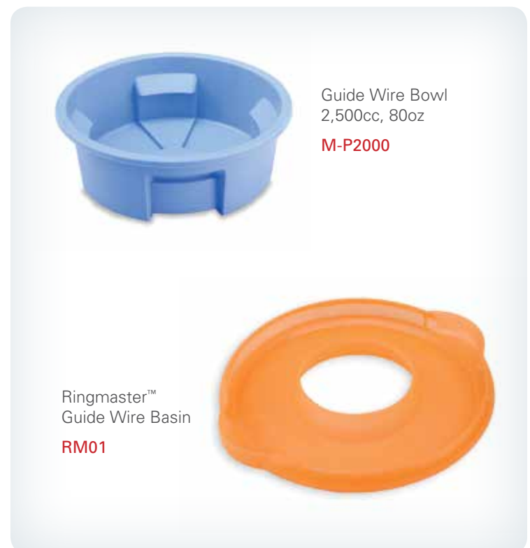
Guide Wire Bowl 2,500cc, 80oz