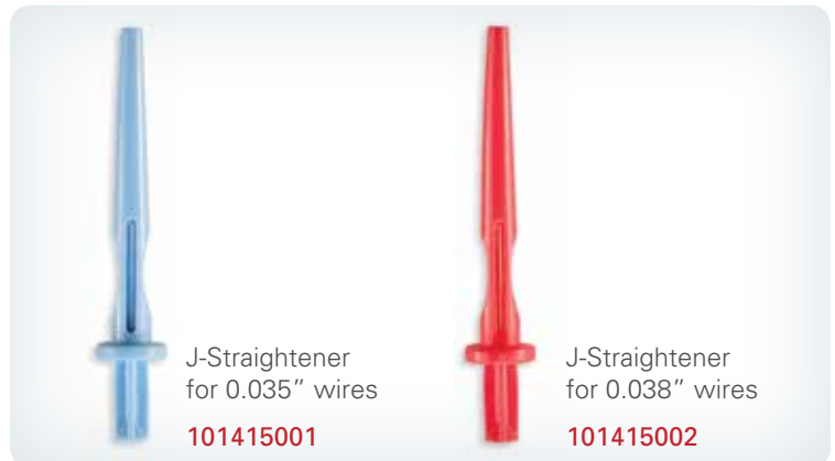
J-Straightener for 0.035" wires