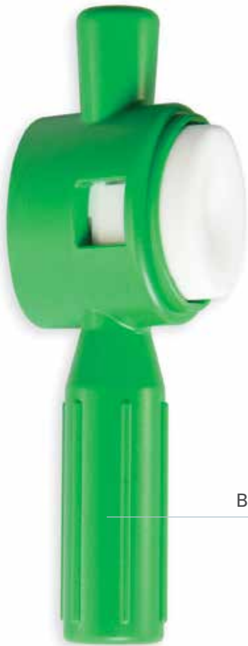
Body Material: Polypropylene

Merit Medical offers a variety of torque devices to meet all of your guide wire needs. Our industry standard "pin vise" can handle a variety of sizes and offers a superior performance due to the copper collet which provides a fantastic grip on any surface. We also offer all-plastic solutions such as our SeaDragon™ which can be utilized with more sensitive coatings. We can also customize our various technologies to meet your needs.