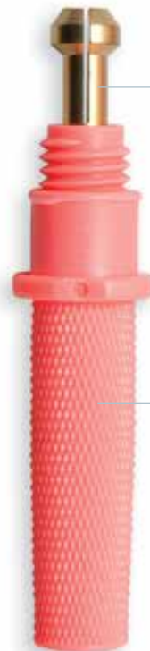
Collet Material: Brass