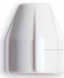
Cap Material: Polycarbonate