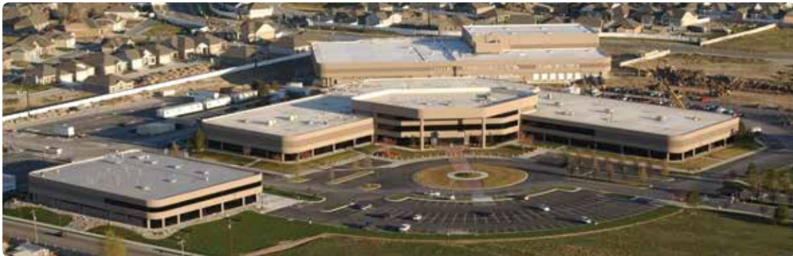
Corporate Headquarters, South Jordan, Utah

Merit Medical Systems, Inc. (NASDAQ: MMSI) has been designing, manufacturing, and marketing single-use medical devices to customers worldwide for over 25 years. Throughout its evolution to a successful global company, Merit has developed the organizational infrastructure required to succeed in a competitive, dynamic, and highly regulated industry. Merit's OEM customers benefit not just from Merit's components and devices, but also from the organization that supports them.