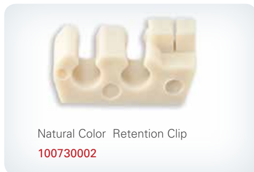
Natural Color Retention Clip