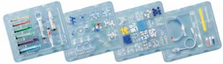
Product Development Kit

Inside U.S. | +1 800 637 4839 Outside U.S. | +1 801 208 4313 Europe | +31 (0)43 3588 224 China | +86 21 5308 7311