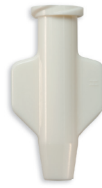
8F Hub, White 100941218