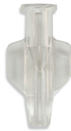
4F Hub, Clear 100942220