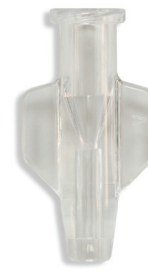
5F Hub, Clear 100942221