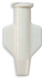
4F Hub, White 100941200