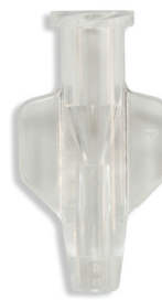
7F Hub, Clear 100942223