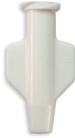
5F Hub, White 100941205