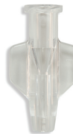
6F Hub, Clear, .083" Inner Lumen 100942222