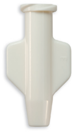
6F Hub, White .050" thru-hole 100941211