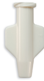
6F Hub, White 100941212