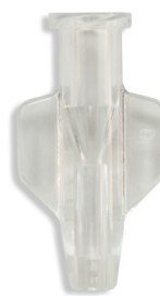
7F Hub, Clear 100942224