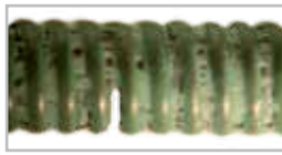
Typical competitor's spray coat

Merit's proprietary process of coating wire prior to coiling results in a smooth, uniform finish not achieved with conventional spray-coated coiled wire that tends to crack.