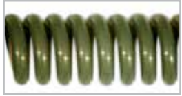
Merit's continuous wire coat