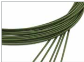
Guide Wire Coil

Merit Medical utilizes a unique spool-to-spool coating process that creates coated guide wire components that are smoother and more consistent with tighter tolerances. Merit's coated guide wire components are available for coated core, coiling and coiled wire in a variety of diameters and base materials, including round or flat; stainless steel and nitinol. Merit offers a complete range of coating options, including PFOA-free PTFE and hydrophilic coatings. In addition, Merit's coated guide wire components can be delivered in a variety of forms such as spooled, straightened, cut to a specific length or coiled.