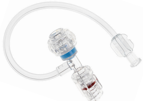
FLO 40XR™ Tuohy Borst with 6" extension tubing and rotating luer Tubing Extension Material: DEHP-Free PVC

Material: Polycarbonate Inner Lumen: 7.3F (.096") Valve Material: Silicone Luer: Rotating