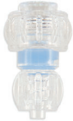
FLO30™ Tuohy Borst

Material: Polycarbonate Inner Lumen: 9F (.118") Valve Material: Silicone Luer: Fixed