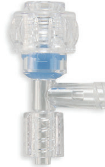
FLO40™ Tuohy Borst with side port

Material: Polycarbonate Inner Lumen: 9F (.118") Valve Material: Silicone Luer: Swivel Nut