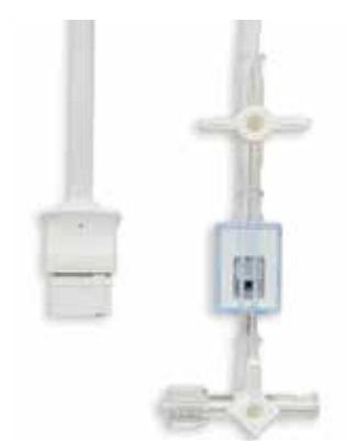
Non-Winged Housing and 3-Way and 1-Way Stopcocks with 48" (122 cm) cable