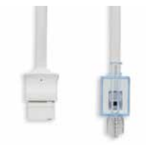
Non-Winged Housing with 48" (122 cm) cable