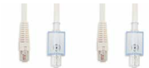
Medium Pressure 0-100 psi