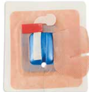
StayFIX® Securement Device for Percutaneous Catheters