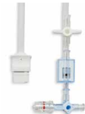
Non-Winged Housing and 3-Way Stopcock with Rotating Male Adapter and 1-Way Stopcock with 48" (122 cm) cable