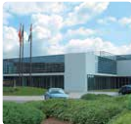
Maastricht, The Netherlands