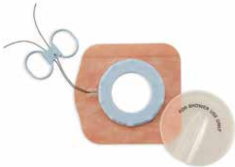
Revolution™ Needleless Non Vascular Catheter Securement Device (6F-24F)