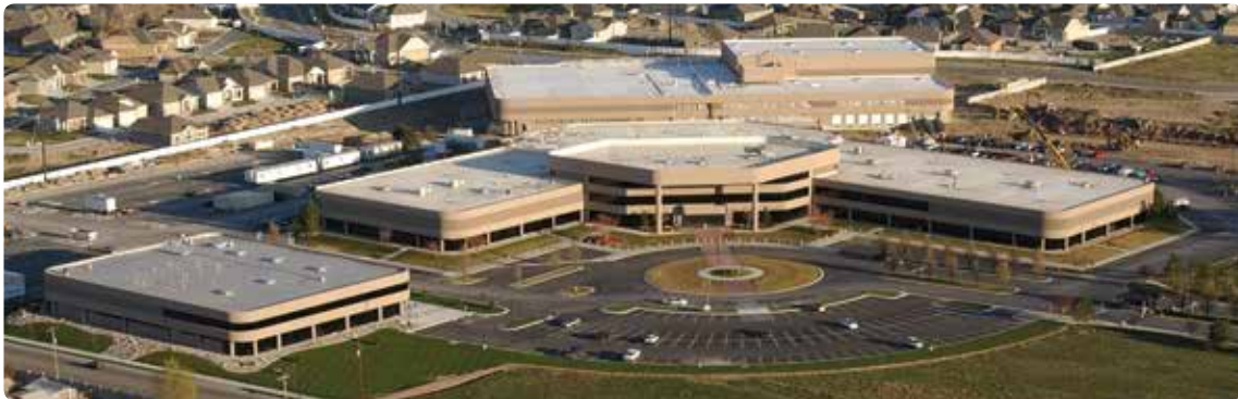
Corporate Headquarters, South Jordan, Utah

Merit Medical Systems, Inc. (NASDAQ: MMSI) has been designing, manufacturing, and marketing single-use medical devices to customers worldwide for over 25 years. Throughout its evolution to a successful global company, Merit has developed the organizational infrastructure required to succeed in a competitive, dynamic, and highly regulated industry. Merit's OEM customers benefit not just from Merit's components and devices, but also from the organization that supports them.