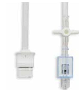
Non-Winged Housing and Bonded 1-Way Stopcock with 48" (122 cm) cable