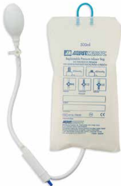
500 mL Pressure Infusor Bag with Dual Pressure Valve