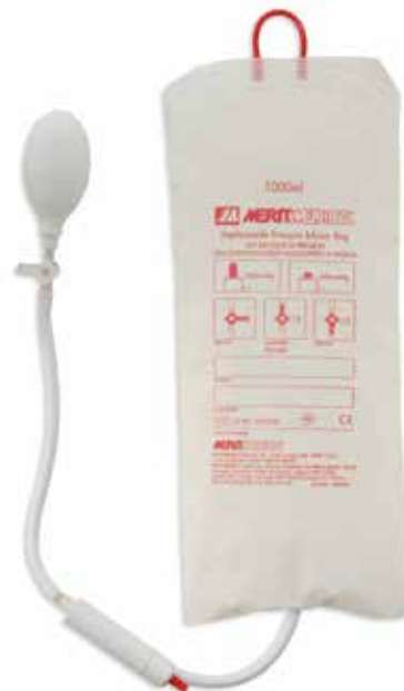
1000 mL Pressure Infusor Bag with Dual Pressure Valve