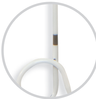
Used in Merit's own Drainage Catheter Line