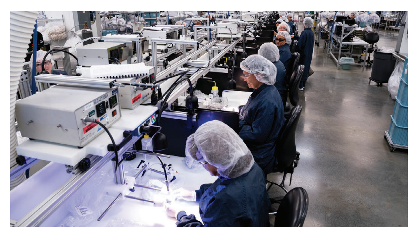
ASPIRATION SETS • TUBING EXTENSION SETS • FLUID ADMINISTRATION SETS HIGH PRESSURE TUBING • PRESSURE MONITORING TUBING

Over the last 30 years, Merit has developed the infrastructure needed for mass customization to meet the unique needs of individual clinics or physicians. This translates into a robust OEM service that allows you to receive a customized configuration as a bulk non-sterile product or even a private labeled sterile product.