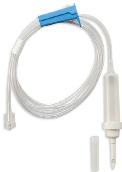
60" Small Bore, Non-Vented Macro Drip Chamber without Micro Filter, Male Luer ID: .120", Inches: 60", OD: .160"