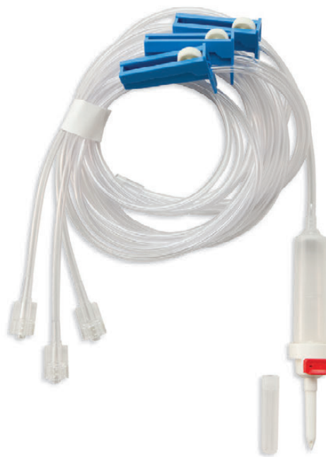
24" Small Bore with User Selectable Macro Drip Chamber without Micro Filter, 48" Small Bore Trifurcated with Roller Clamps, Male Luers ID: .120", Inches: 24", OD: .160"