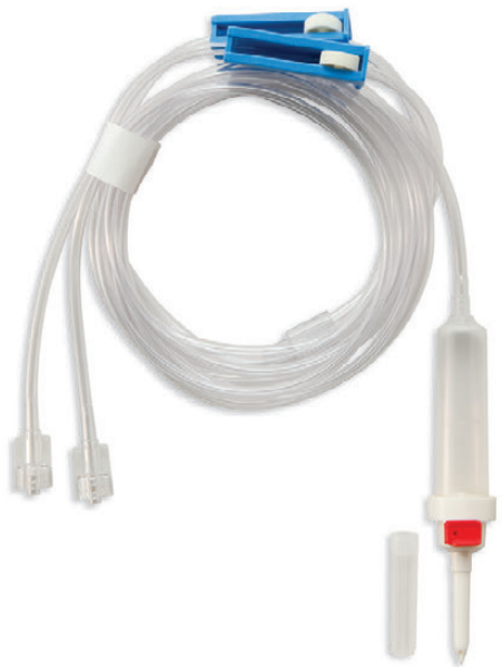
24" Small Bore with User Selectable Macro Drip Chamber without Micro Filter, 48" Small Bore Bifurcated with Roller Clamps, Male Luers ID: .120", Inches: 24", OD: .160"