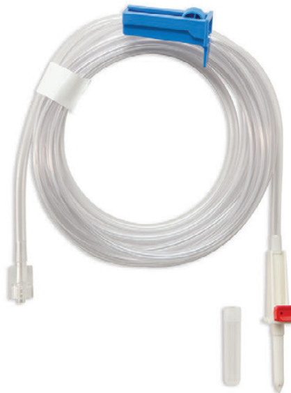
108" Large Bore with User Selectable Vented Macro Drip Chamber with Micro Filter, 108" Large Bore, Bifurcated with Roller Clamps, Male Luers ID: .108", Inches: 108", OD: .160"