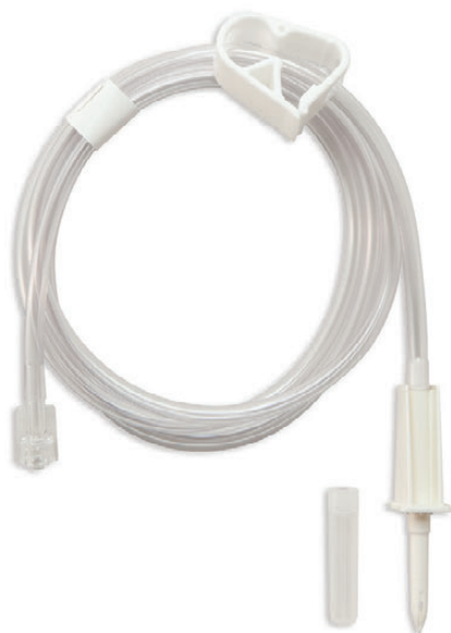
48" Large Bore Non-vented Macro Drip Chamber with Micro Filter, 48" Large Bore, with Roller Clamps, Male Luers ID: .120", Inches: 48", OD: .160"