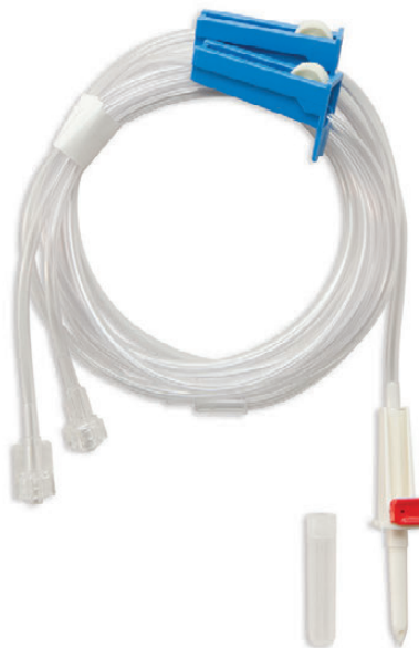
24" Small Bore with Vented Macro Drip Chamber with Micro Filter, 24" Small Bore Bifurcated with Roller Clamps, Male Luers ID: .24", Inches: 524", OD: .160"