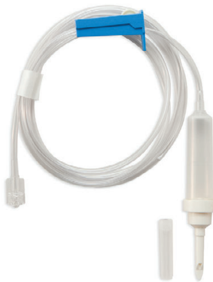
72" Small Bore, Non-Vented Macro Drip Chamber without Micro Filter, Male Luer ID: .120", Inches: 72", OD: .160"