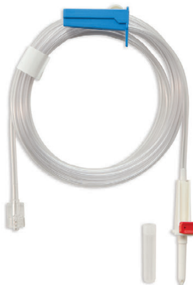
108" Large Bore, Vented Macro Drip Chamber with Micro Filter, Male Luer ID: .120", Inches: 108", OD: .160"