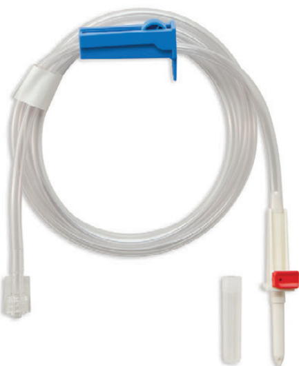
48" Large Bore with User Selectable Vented Macro Drip Chamber with Micro Filter, 48" Large Bore, Bifurcated with Roller Clamps, Male Luers ID: .120", Inches: 48", OD: .160"