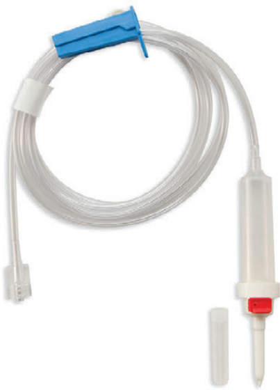
72" Small Bore, Vented Macro Drip Chamber, without Micro Filter, Male Luer ID: .120", Inches: 72", OD: .160"