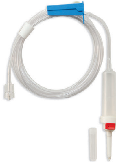
60" Small Bore, Vented Macro Drip Chamber, without Micro Filter, Male Luer ID: .120", Inches: 60", OD: .160"