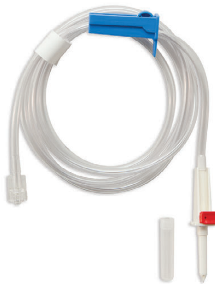
50" Large Bore with User Selectable Vented Macro Drip Chamber with Micro Filter, 50" Large Bore, Bifurcated with Roller Clamps, Male Luers ID: .120", Inches: 50", OD: .160"