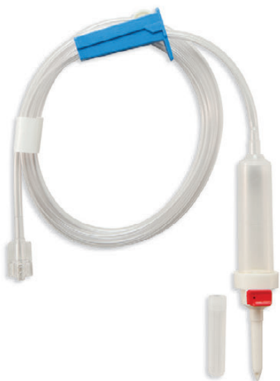
60" Small Bore, Vented Macro Drip Chamber without Micro Filter, Male Luer ID: .120", Inches: 60", OD: .160"