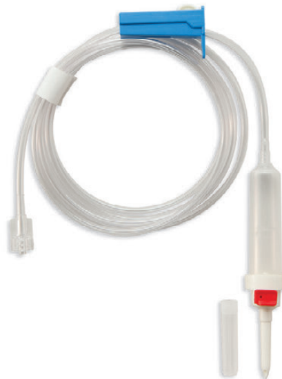
72" Small Bore, Vented Macro Drip Chamber without Micro Filter, Male Luer ID: .120", Inches: 72", OD: .160"