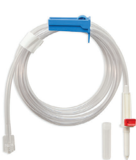
72" Large Bore with User Selectable Vented Macro Drip Chamber with Micro Filter, 72" Large Bore Bifurcated with Roller Clamps, Male Luers ID: .72", Inches: 50", OD: .160"