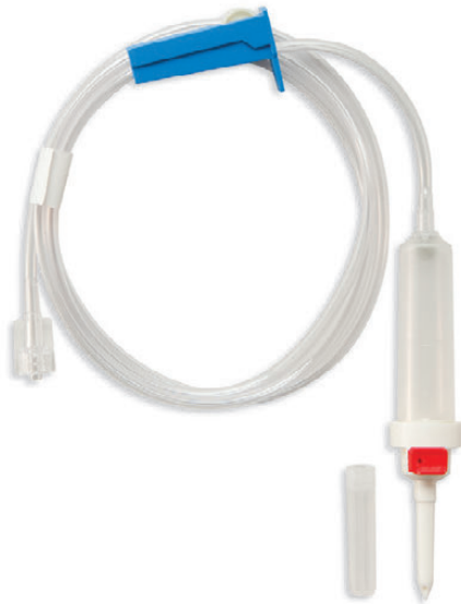
48" Small Bore, Vented Macro Drip Chamber without Micro Filter, Male Luer ID: .120", Inches: 48", OD: .160"