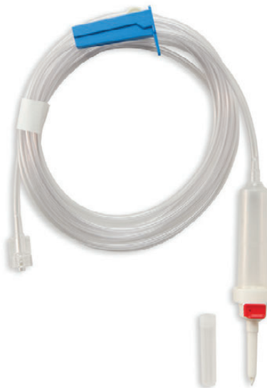
108" Small Bore, Vented Macro Drip Chamber, with Micro Filter, Male Luer ID: .120", Inches: 60", OD: .160"