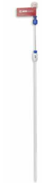
Straight Tip, 8.5F, 4 Drainage Holes Non-Locking (NL), Universal Drainage, Blue Hub