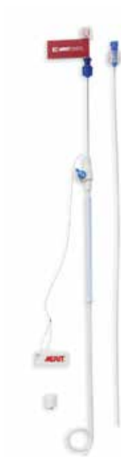
8.5F, 8 Drainage Holes Blue Hub