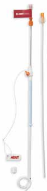
14F, 9 Drainage Holes Orange Hub