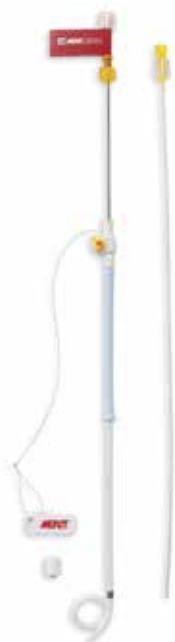
12F, 8 Drainage Holes Yellow Hub