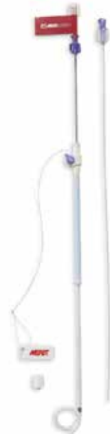
10F, 8 Drainage Holes Purple Hub