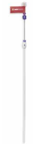
Straight Tip, 10F, 4 Drainage Holes Non-Locking (NL), Universal Drainage, Purple Hub