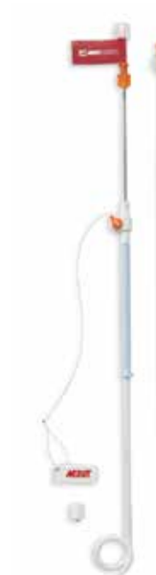
14F, 9 Drainage Holes Orange Hub