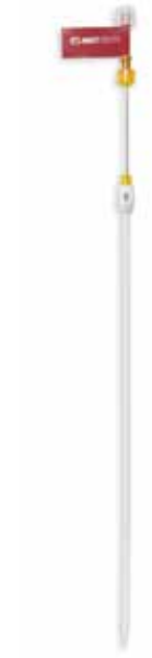
Straight Tip, 12F, 5 Drainage Holes Non-Locking (NL), Universal Drainage, Yellow Hub