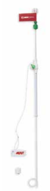
6.5F, 7 Drainage Holes Green Hub