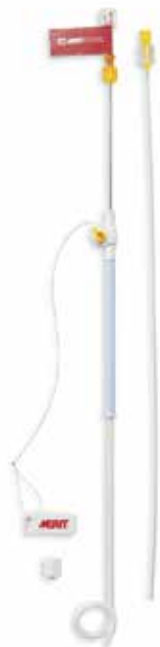
12F, 8 Drainage Holes Yellow Hub