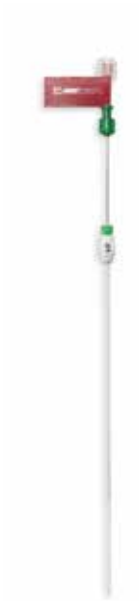
Straight Tip, 6.5F, 4 Drainage Holes Non-Locking (NL), Universal Drainage, Green Hub