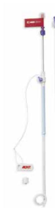
10F, 8 Drainage Holes Purple Hub