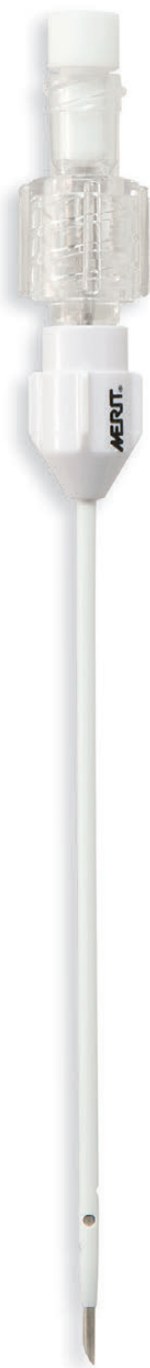
ONE-STEP™ Centesis Catheter (Luer Locked)

May not be available for all OEM applications.